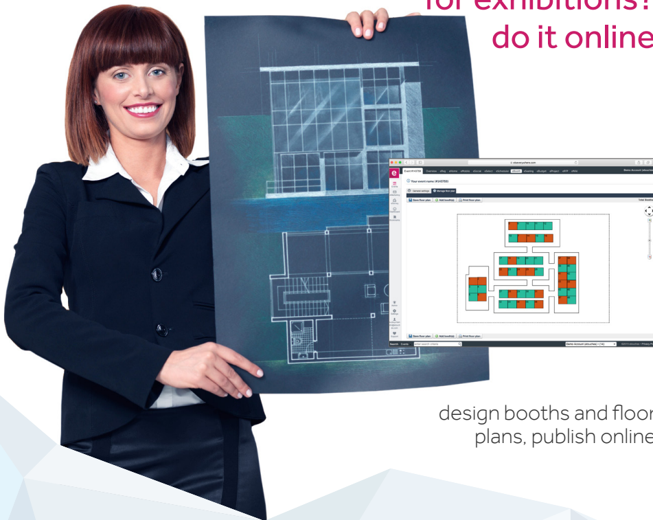
design booths and floor plans, publish online